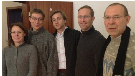
Discussion with the film team