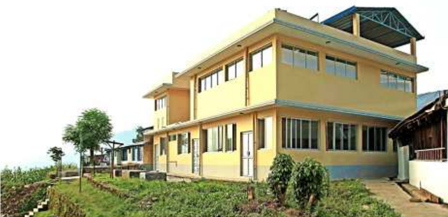
Ampipal: new building, June 2012

In January 2013 we plan for choosing the new doctor.