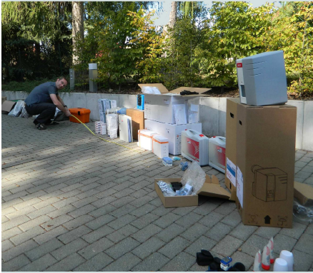
Grimma: Packing donations in October 2012