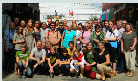
Nepalmed group October 2012