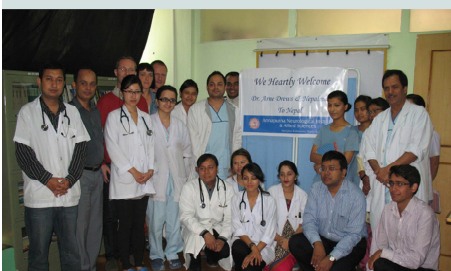
Reception at Annapurna Neurological Institute