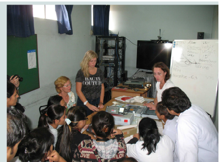
Kathmandu Model Hospital Lungenfunktionstraining