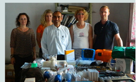
Donations for Ampipal