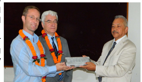
Ceremony at Kirtipur Hospital, October 2012

Kathmandu Model Hospital (KMH) will open its own teaching hospital with 200 beds in Kirtipur in March 2013 and plans to found a Medical College in September 2013. We handed over a donation of surgical instruments from the German army in the presence of the German ambassador Mr. Frank Meyke. The Model Hospital now features its own internet site: www.phectnepal.org