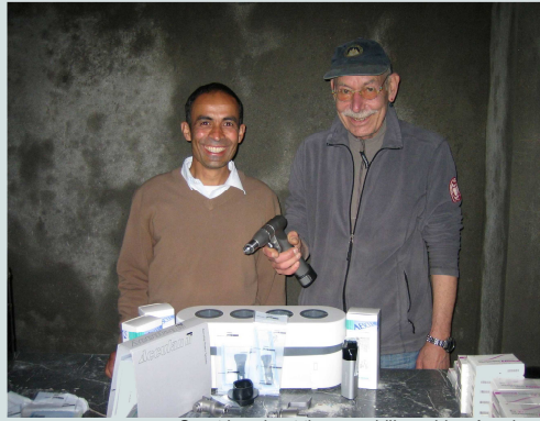
Great joy about the new drill machine Acculan