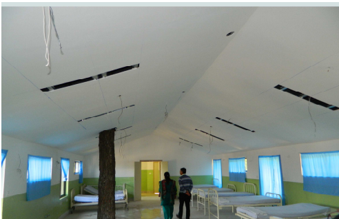
Kirtipur Baum auf Station

The X-ray device of Amppipal Hospital urgently has to be improved in power. To save costs for material upgrading the device into a digital unit is efficient.