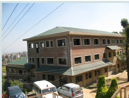
Kirtipur Neubau Lehrkrankenhaus