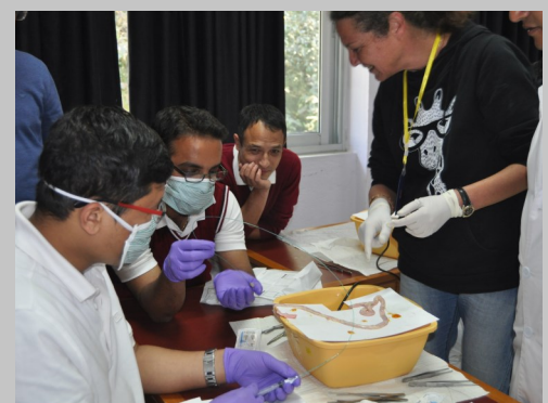
Vascular workshop in Dhulikel