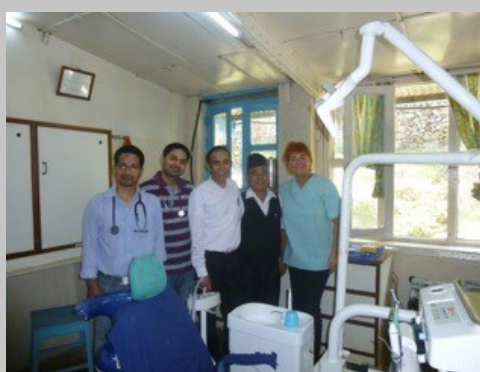
New dental unit in Amppipal