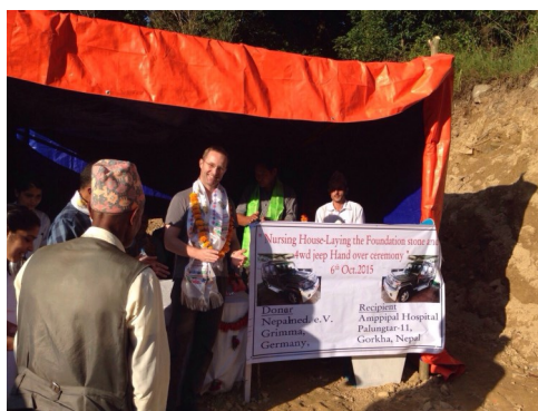
Handing over a four-wheel-drive and foundation stone for nurses quarter, Amppipal