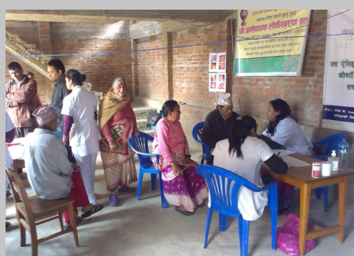
Ultrasound camp in Kirtipur