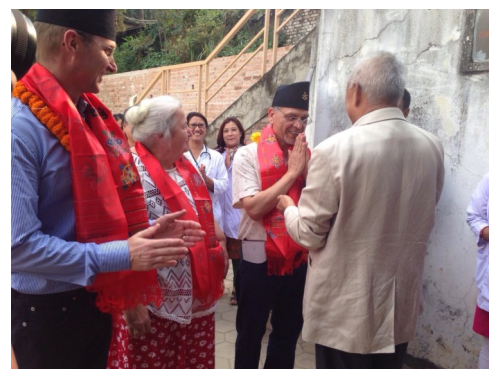
Inauguration of Radiology, Kirtipur

Earthquake help for the villagers: Several initiatives collected great amounts of donations to rebuild destroyed villages. Until October we handed these funds over to village development committees around Amppipal. In the Sindhupalchok region thanks to a Greifswalder Initiative immediate aid with food and necessities like quilts, blankets, tarps and construction material were given to the farmers.