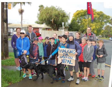
Benefizwalk, Auckland, NZ