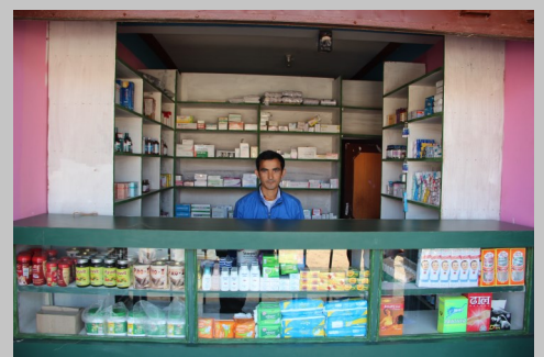
New pharmacy in Tati Pokhari