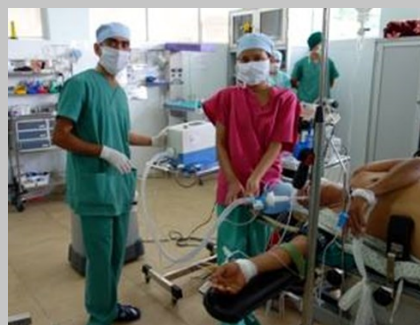
Ventilator in OT in Ampipal