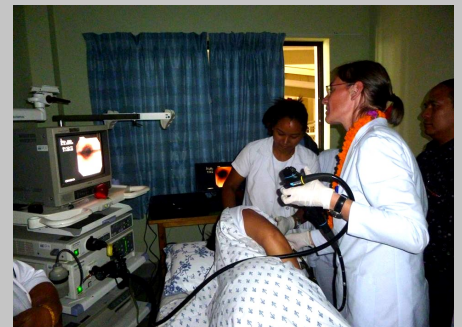
The first patient