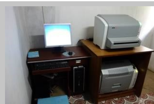
Digital x-ray in Ampipal