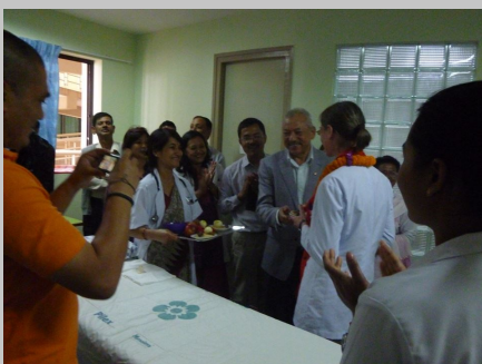
Inauguration of endoscopy in Kirtipur

Since September we co-operate with the Kuratorium „Tuberculosis in the World e.V.“ based in Munich. This organization is partner of the only nepalese lab GENETUP, where swift and reliable diagnosis and resistancy testing of tuberculosis can be done. The tuberculosis department in Munich is the World Health Organization's WHO partner lab for Nepal. In Kirtipur a tuberculosis ward shall be opened.