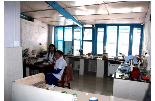
Refurbished lab in Ampipal

Like every year, in 2014 numerous specialists, doctors and nurses, supported the staff in Ampipal.