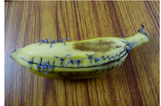
Sewing course for students in Ampipal