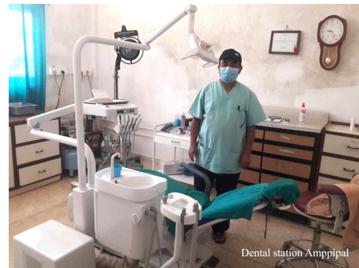
Dental station Amppipal