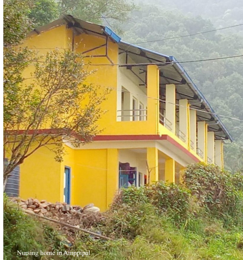
Nursing home in Amppipal

In order to continue our support for Nepal, we ask for your donations.