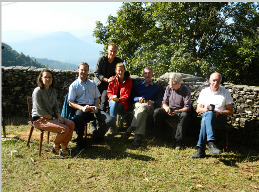
Rotary, Dentist without Limits, volunteers and Nepalmed e.V. united in Amppipal.