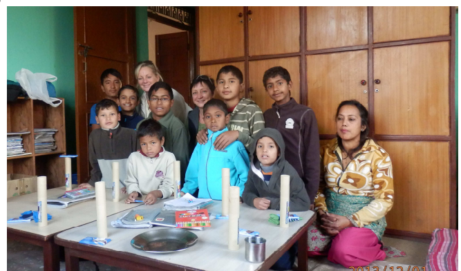
Visit to the orphanage in Budhanilkantha

At the moment patient numbers are stable. From April 2012 until April 2013 about 19175 patients were treated out-patient and 2126 patients on the wards. At the hospital 184 births took place with 42 cesarean sections, around 1200 operations were performed. The new building's rooms dried thanks to the ventilation planned by Mrs. Reinosch. Air con was installed at the operating theatre. The mobile x-ray was installed by Dr. Dingels (Senior Expert Service) in March. Thanks to German Rotary Volunteer Doctors for the Transport!