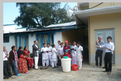
Teaching of hygiene

Donations: At the 5. member's journey in Dezember 2013 the new transport jeep (donation from Nepalmed: 18000 €) was handed over. Further donations in cash, and devices like inhalators, breathing coaches and milk pumps were given and instructed.