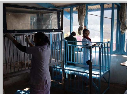
cleaning on the wards