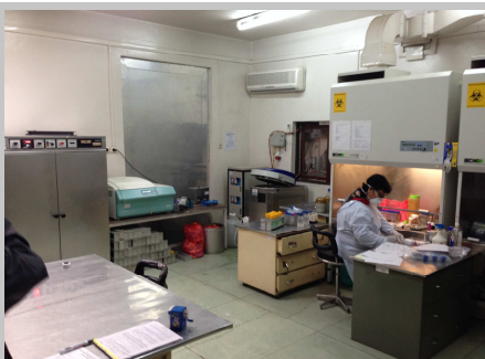
Laboratory in Chest Hospital

At 17./18. January 2014 our yearly travel meeting takes place. This time at a new location at Wehlitz Estate near Leipzig. On Saturday morning you can hear lectures on working in Nepal. Register: nepalmed@gmx.de .