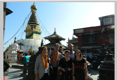
Team of lung function course