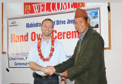
Handing over donations

An English language teacher gave lessons to the nurses in December.