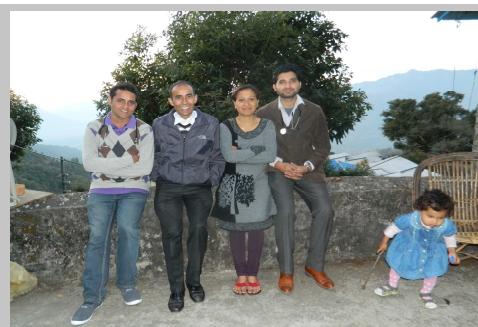
The Nepalese doctors in Amppipal

operation with the WHO reference laboratory in Munich – Gauting (Germany) was established. A highly precise testing of resistency of bacteria and antibiotics is possible and available. Hence, patients with resistant strains of TB bacteria can be treated sufficiently and under direct supervision. The medication for the 18-20 months of second line treatment is extremely expensive, but is available at Kalimati. Patients do receive a monthly allowance of 1500 NRP, if they co-operate well.