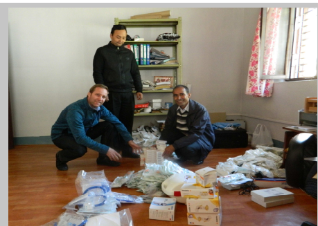
Handing over donations